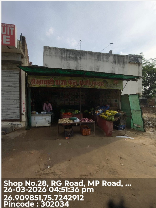
Shop No.28, RG Road, MP Road, ... 26-03-2026 04:51:36 pm 26.909851,75.7242912 Pincode : 302034

Shop front photo with full vertical viewpoint i.e; shop board, sealing, entrance, ground on which the shop is established (cemented, pilers, bricks, stands, mud, wheels etc.)