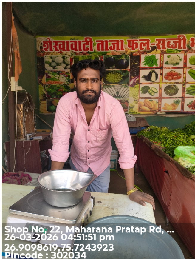
Shop No. 22, Maharana Pratap Rd, ... 26-03-2026 04:51:51 pm 26.9098619,75.7243923 Pincode : 302034

Take Photo of Person Met Inside the Shop