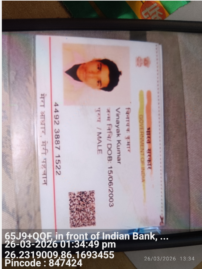
Photo of ID Proof