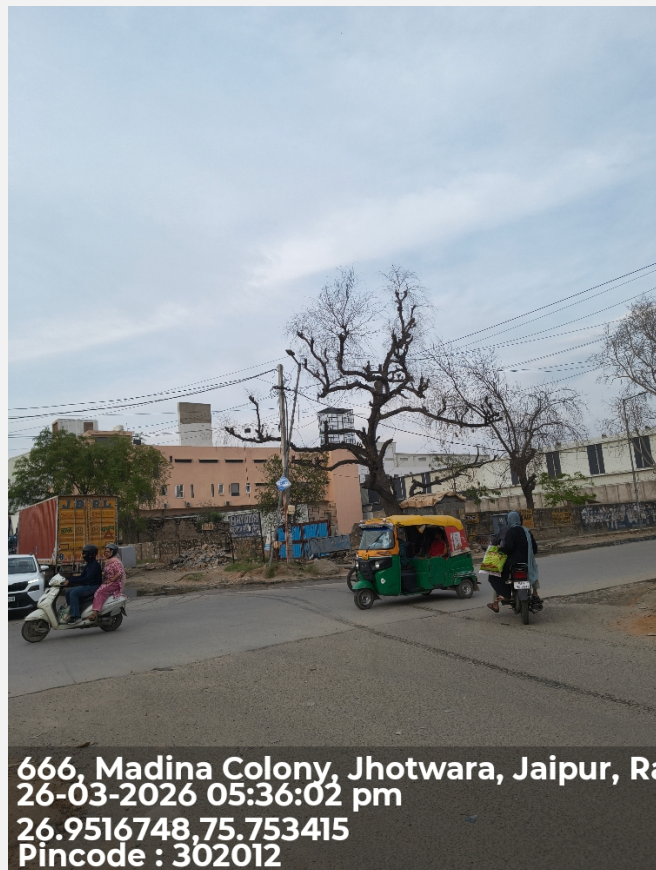
666, Madina Colony, Jhotwara, Jaipur, Ra 26-03-2026 05:36:02 pm 26.9516748,75.753415 Pincode : 302012

Shop front with horizontal view covering the left & right of the shop establishing if the shop is an individual structure, in a marketplace, highway, isolated place, in a cluster framework.