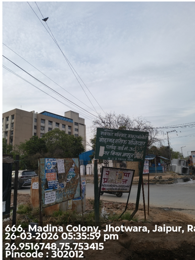
666, Madina Colony, Jhotwara, Jaipur, Ra 26-03-2026 05:35:59 pm 26.9516748,75.753415 Pincode : 302012

Take Photo of QR Code/Soundbox/EDC Machine