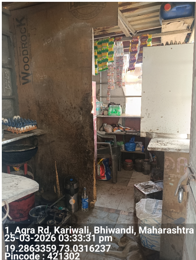
1, Agra Rd, Kariwali, Bhiwandi, Maharashtra 25-03-2026 03:33:31 pm 19.2863359,73.0316237 Pincode : 421302

Shop inside with inventory photos establishing that the inside is of the same shop where the front photo was taken