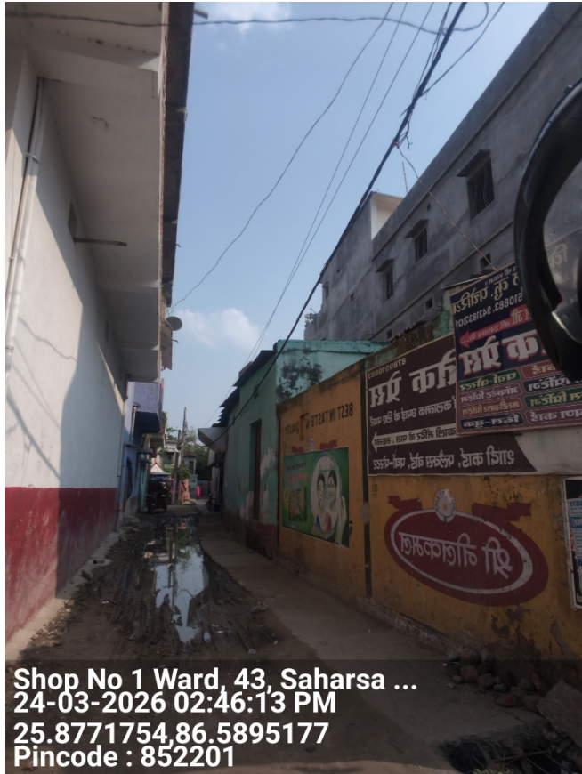
Shop No 1 Ward, 43, Saharsa ... 24-03-2026 02:46:13 PM 25.8771754,86.5895177 Pincode : 852201

Shop inside with inventory photos establishing that the inside is of the same shop where the front photo was taken