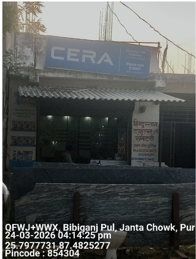
Photo with UPI Scanner

QFWJ+WWX, Bibiganj Pul, Janta Chowk, Pur 24-03-2026 04:14:25 pm 25.7977731,87.4825277 Pincode : 854304