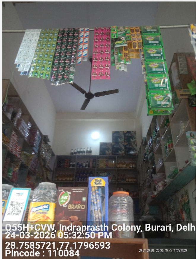
Photo of Outside Shop