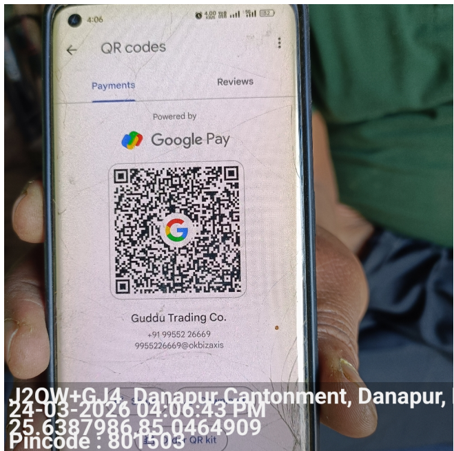
Photo with UPI Scanner