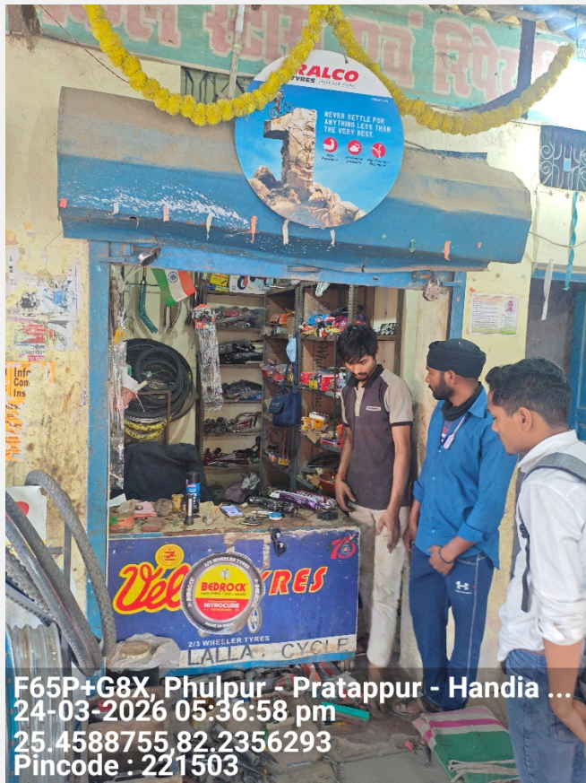
F65P+G8X, Phulpur - Pratappur - Handia ... 24-03-2026 05:36:58 pm 25.4588755,82.2356293 Pincode : 221503

Shop front with horizontal view covering the left & right of the shop establishing if the shop is an individual structure, in a marketplace, highway, isolated place, in a cluster framework.