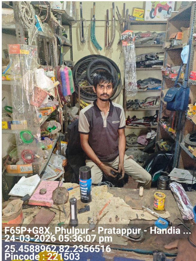
F65P+G8X, Phulpur - Pratappur - Handia ... 24-03-2026 05:36:07 pm 25.4588962,82.2356516 Pincode : 221503

Shop inside with inventory photos establishing that the inside is of the same shop where the front photo was taken