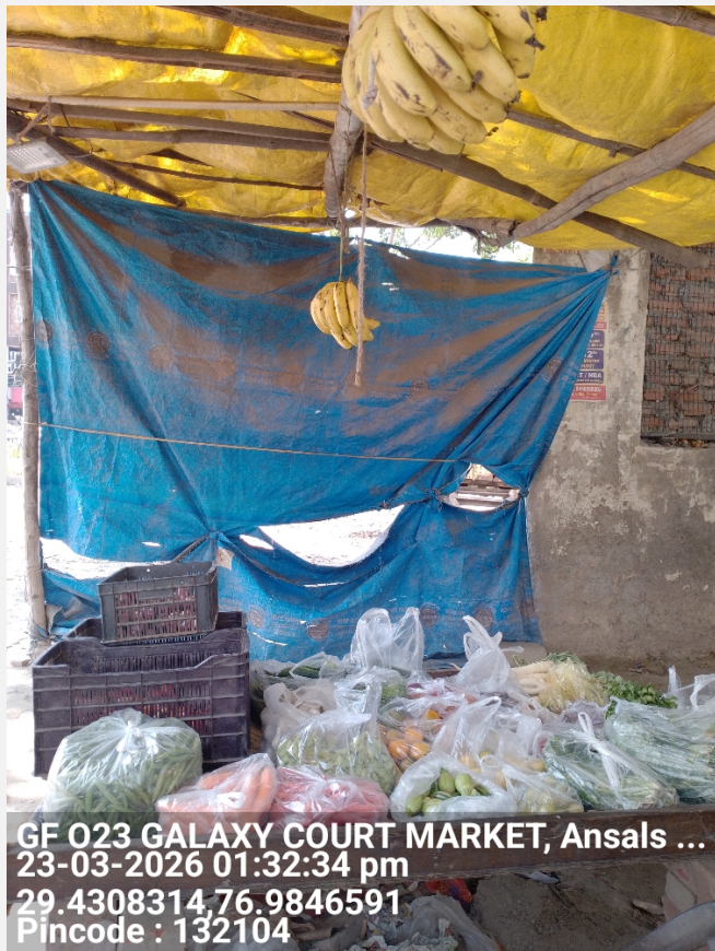
GF 023 GALAXY COURT MARKET, Ansals ... 23-03-2026 01:32:34 pm 29.4308314,76.9846591 Pincode : 132104

Shop front with horizontal view covering the left & right of the shop establishing if the shop is an individual structure, in a marketplace, highway, isolated place, in a cluster framework.