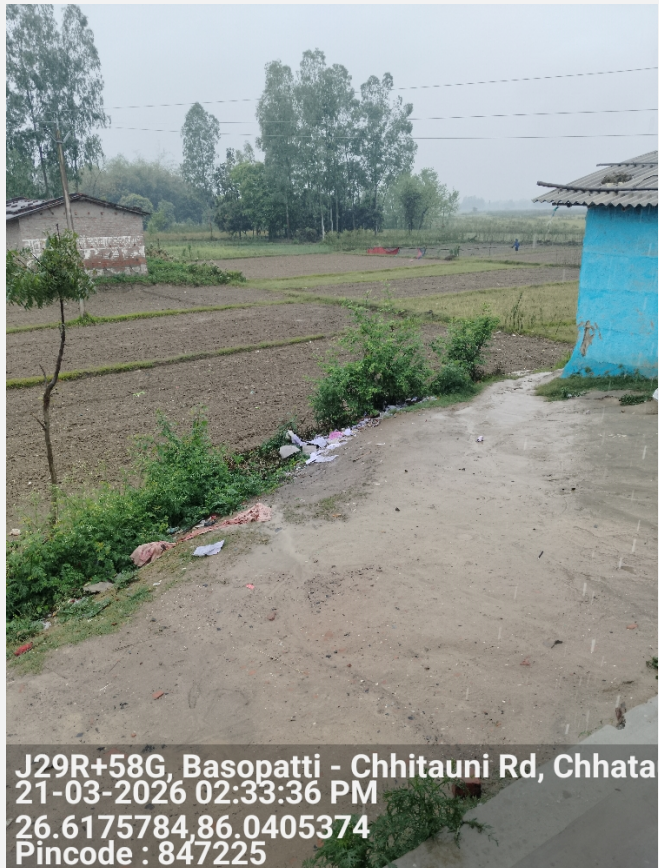
Photo of Outside Shop