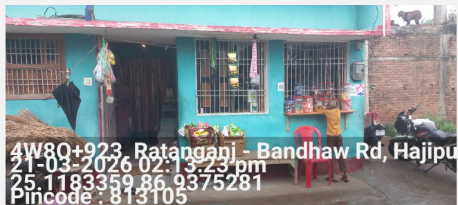
Shop Photo Outside