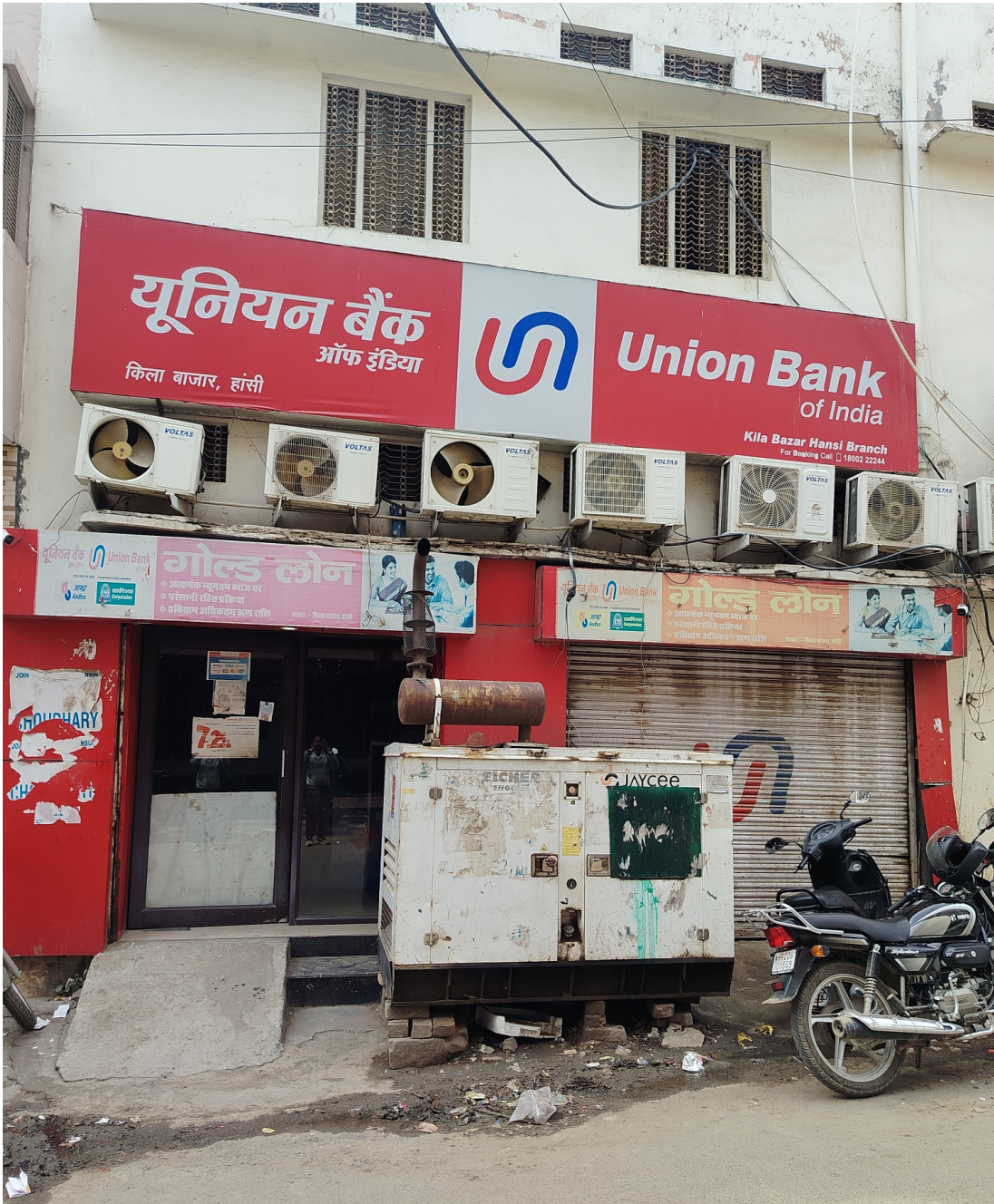
12, Kila Bazar, Mohalla Phika Peer, ... 29-10-2026 01:40:51 am Pmcode : 425033