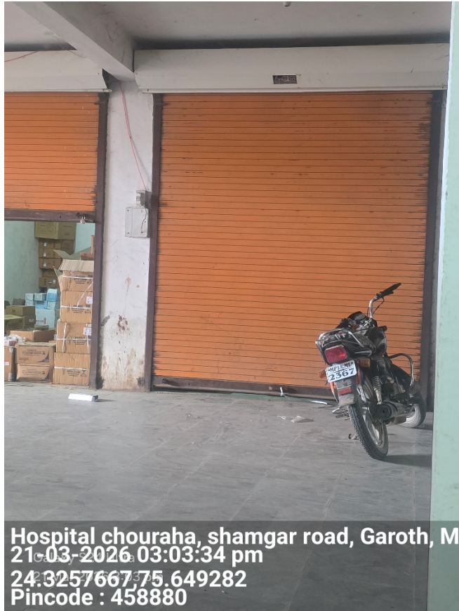
Hospital chouraha, shamgar road, Garoth, M 21-03-2026 03:03:34 pm 24.3257667,75.649282 Pincode : 458880

Shop front photo with full vertical viewpoint i.e; shop board, sealing, entrance, ground on which the shop is established (cemented, pilers, bricks, stands, mud, wheels etc.)