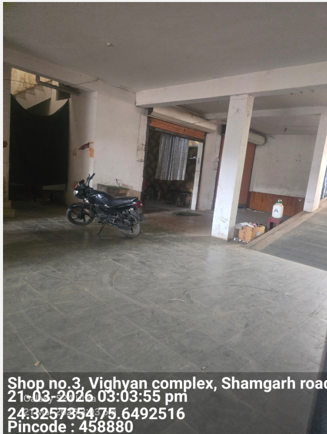
Shop no.3, Vighyan complex, Shamgarh road 21-03-2026 03:03:55 pm 24.3257354,75.6492516 Pincode : 458880

Take Photo of Person Met Inside the Shop