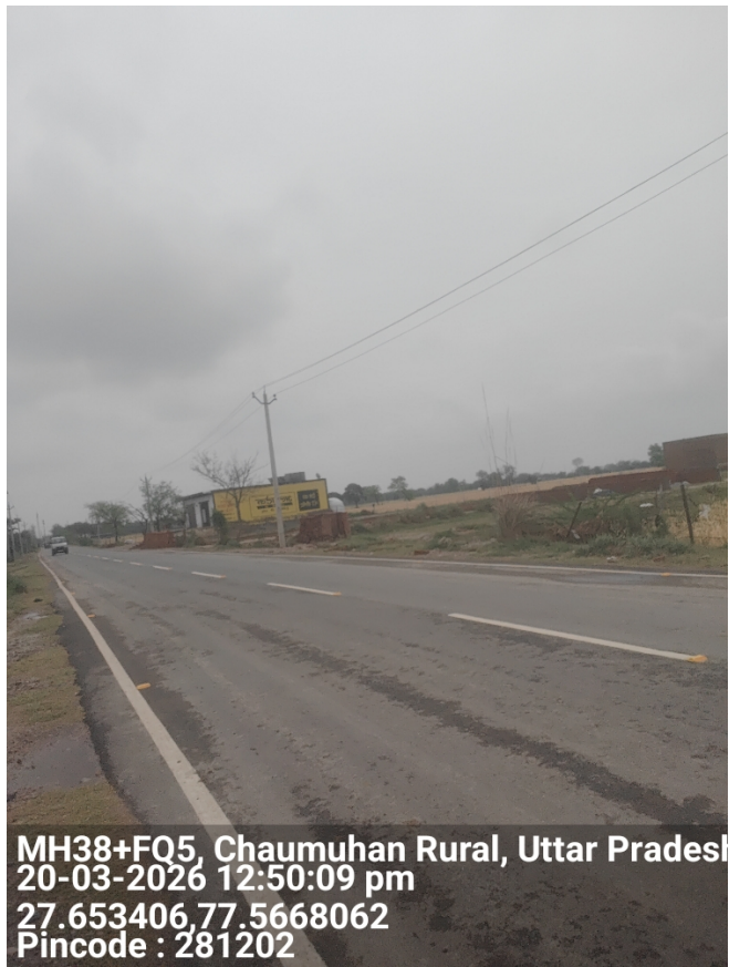
MH38+FQ5, Chaumuhan Rural, Uttar Pradesh 20-03-2026 12:50:09 pm 27.653406,77.5668062 Pincode : 281202

Shop front photo with full vertical viewpoint i.e; shop board, sealing, entrance, ground on which the shop is established (cemented, pilers, bricks, stands, mud, wheels etc.)