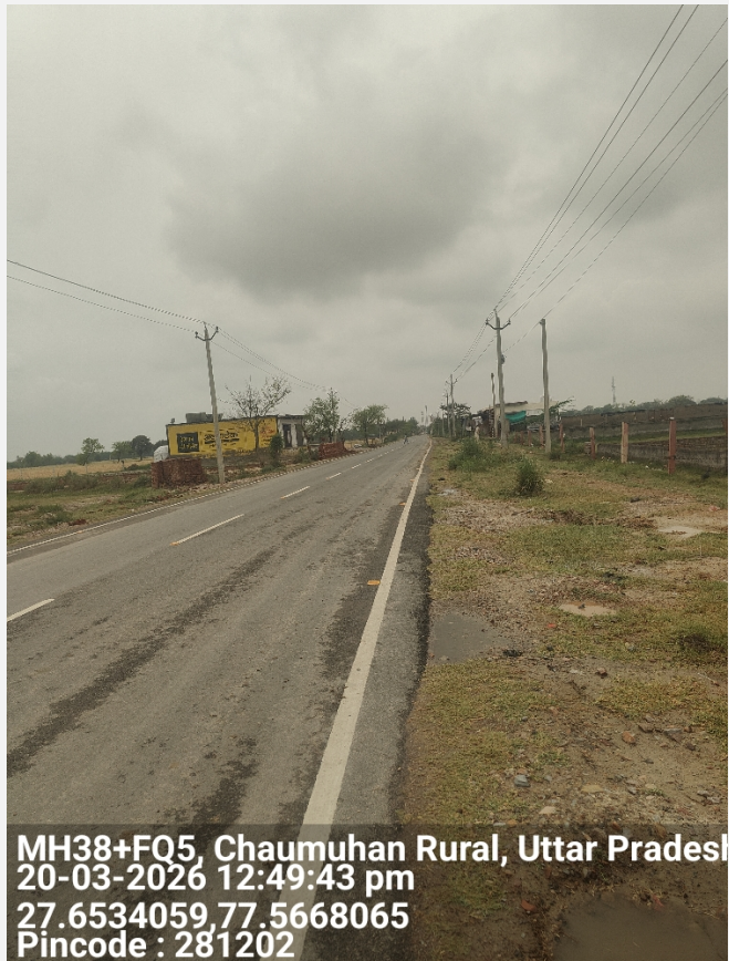
MH38+FQ5, Chaumuhan Rural, Uttar Pradesh 20-03-2026 12:49:43 pm 27.6534059,77.5668065 Pincode : 281202

Take Photo of Person Met Inside the Shop