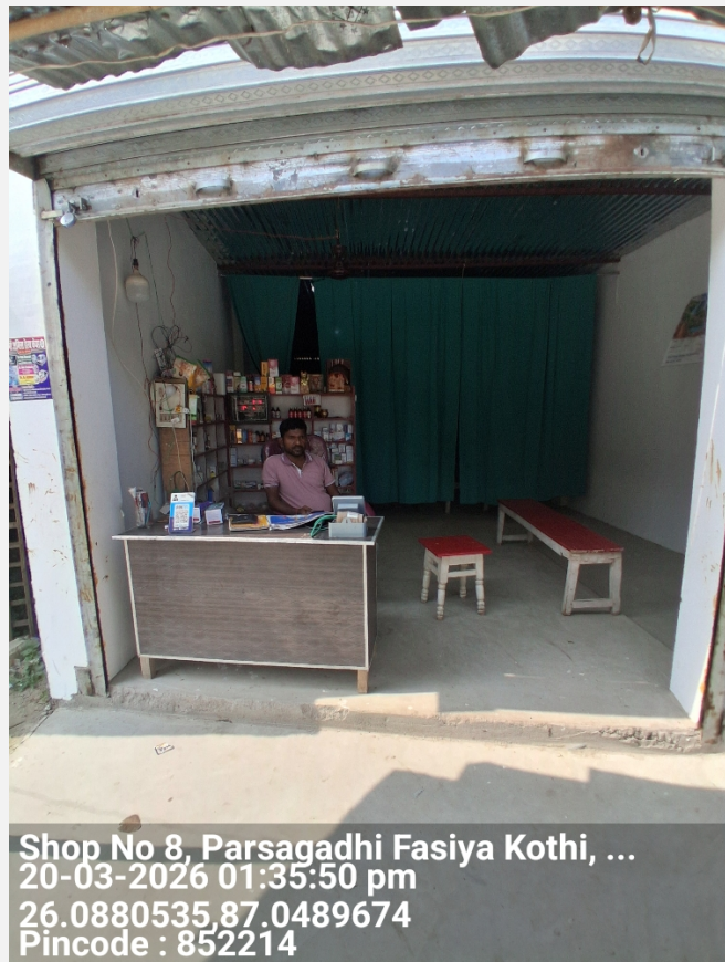
Shop No 8, Parsagadhi Fasiya Kothi, ... 20-03-2026 01:35:50 pm 26.0880535,87.0489674 Pincode : 852214

Shop front with horizontal view covering the left & right of the shop establishing if the shop is an individual structure, in a marketplace, highway, isolated place, in a cluster framework.