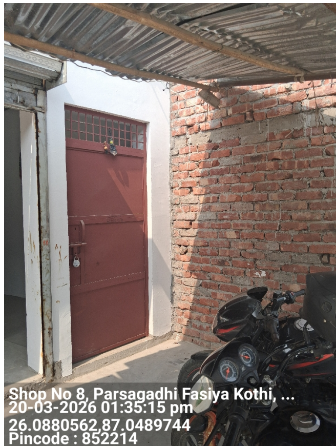
Shop No 8, Parsagadhi Fasiya Kothi, ... 20-03-2026 01:35:15 pm 26.0880562,87.0489744 Pincode : 852214

Shop inside with inventory photos establishing that the inside is of the same shop where the front photo was taken