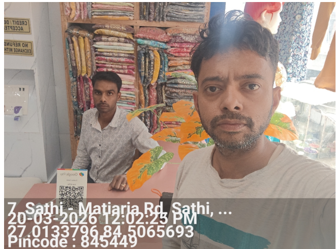
Photo with Agent