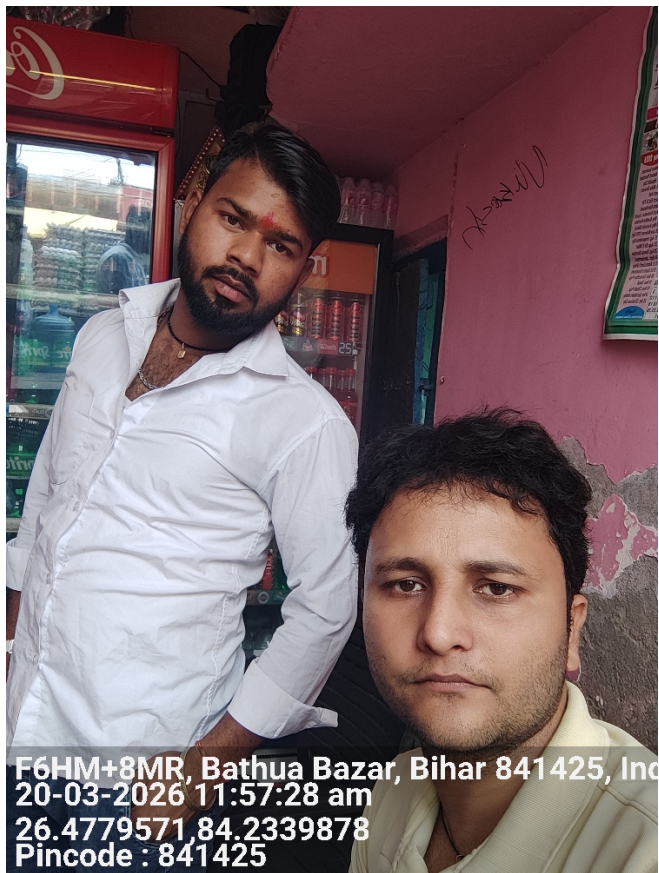
Photo with Agent