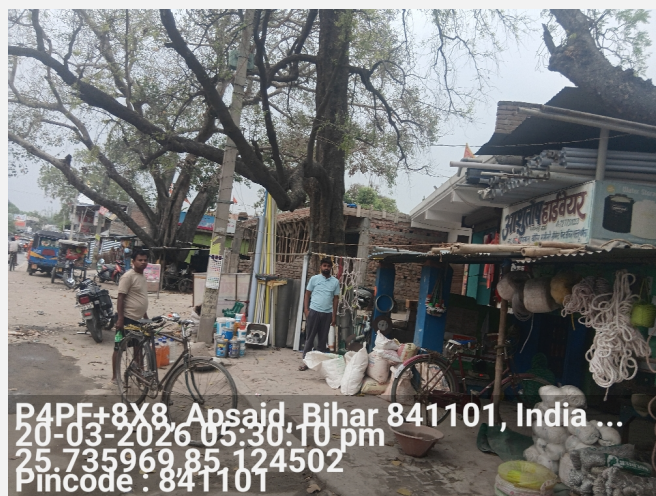
Shop Photo Outside