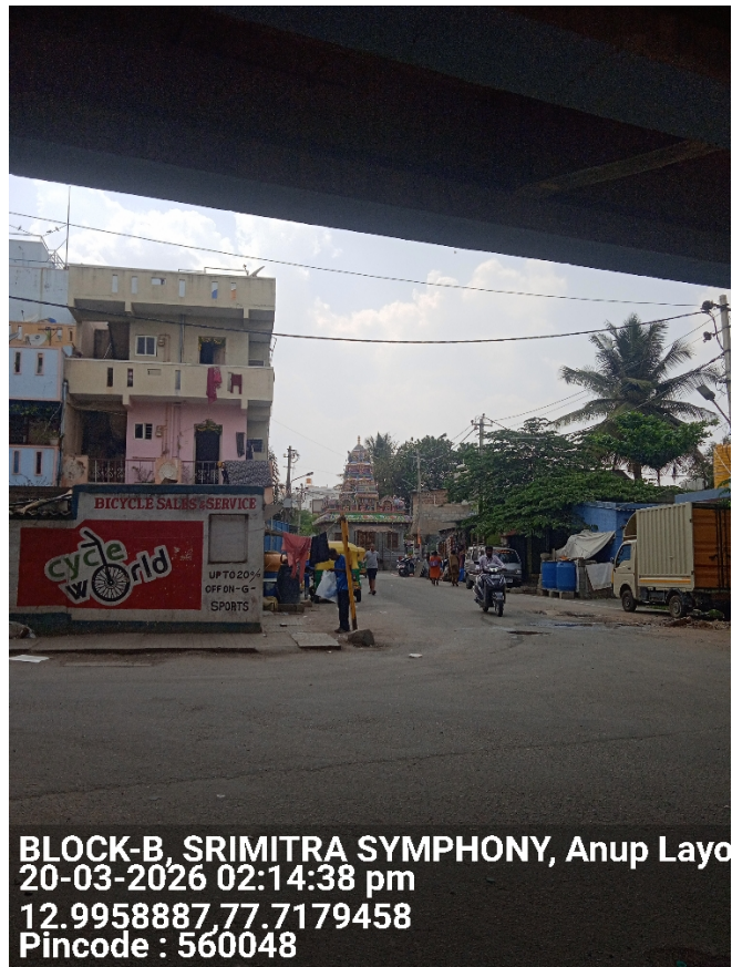
BLOCK-B, SRIMITRA SYMPHONY, Anup Laya 20-03-2026 02:14:38 pm 12.9958887,77.7179458 Pincode : 560048

Shop front photo with full vertical viewpoint i.e; shop board, sealing, entrance, ground on which the shop is established (cemented, pilers, bricks, stands, mud, wheels etc.)