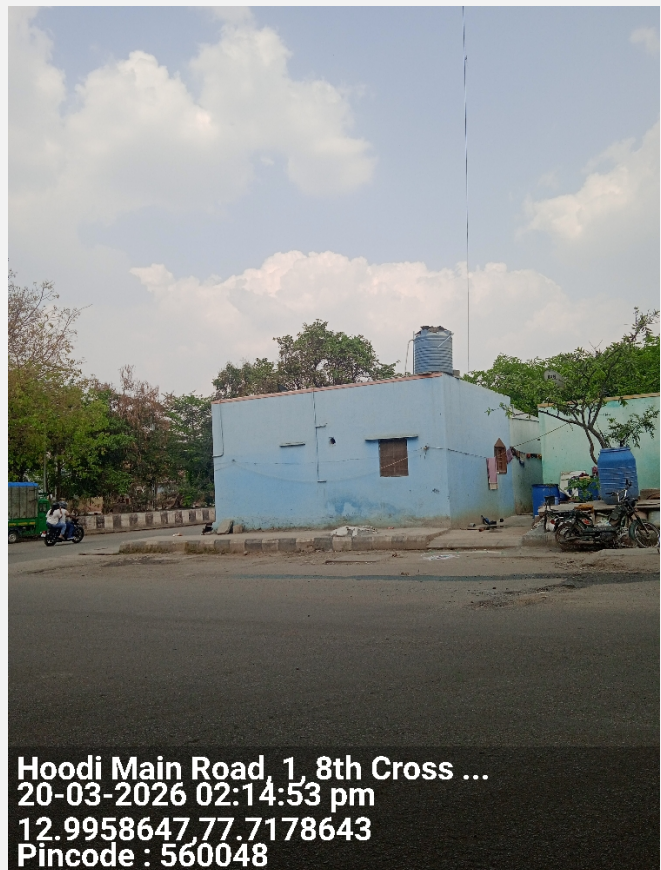
Hoodi Main Road, 1, 8th Cross ... 20-03-2026 02:14:53 pm 12.9958647,77.7178643 Pincode : 560048

Take Photo of Person Met Inside the Shop