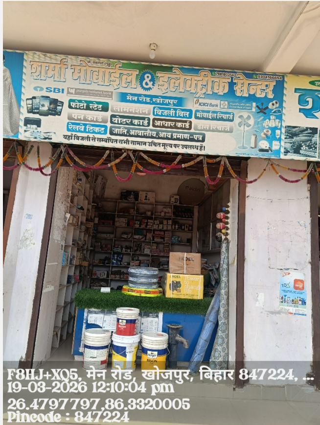
Shop Photo Outside