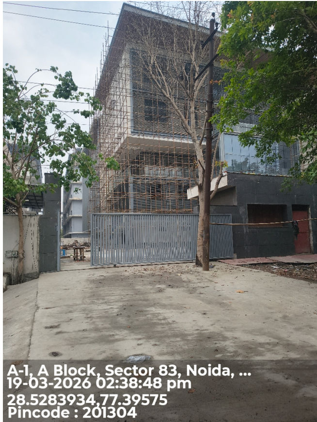
A-1, A Block, Sector 83, Noida, ... 19-03-2026 02:38:48 pm 28.5283934,77.39575 Pincode : 201304

Shop front with horizontal view covering the left & right of the shop establishing if the shop is an individual structure, in a marketplace, highway, isolated place, in a cluster framework.