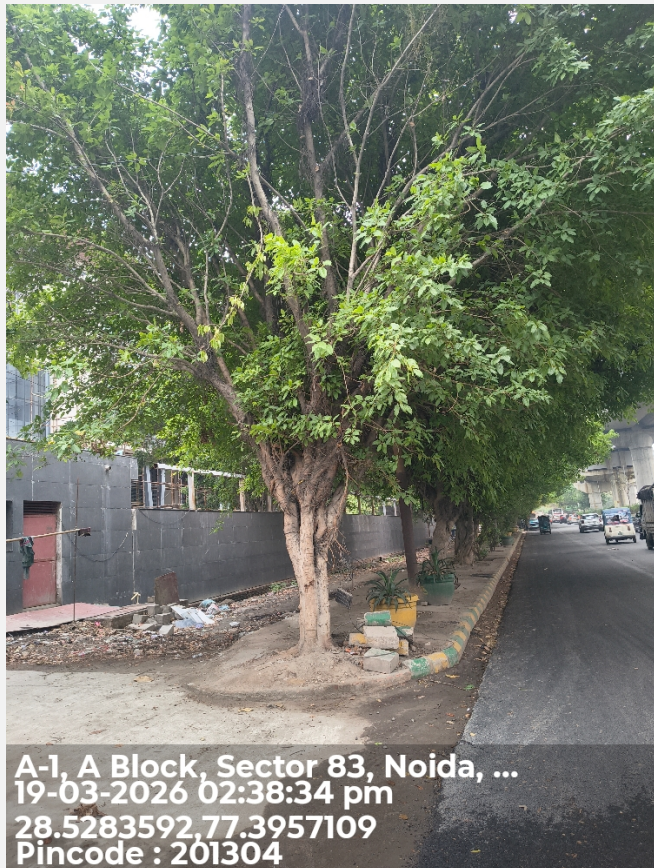
A-1, A Block, Sector 83, Noida, ... 19-03-2026 02:38:34 pm 28.5283592,77.3957109 Pincode : 201304

Shop inside with inventory photos establishing that the inside is of the same shop where the front photo was taken