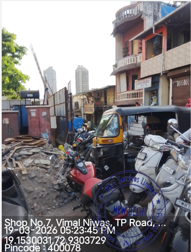
Shop No.7, Vimal Niwas, TP Road, ... 19-03-2026 05:23:45 PM 19.1530031,72.9303729 Pincode : 400078