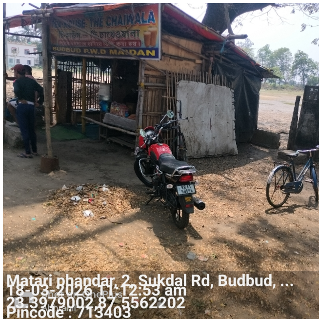
Photo with UPI Scanner