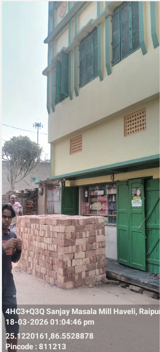
Photo of Outside Shop