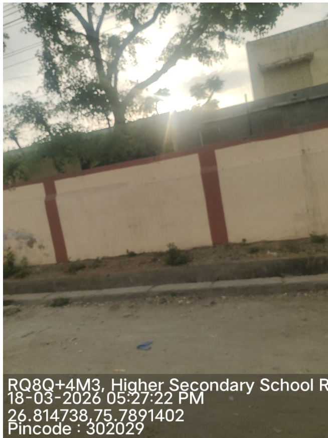
RQ8Q+4M3, Higher Secondary School R 18-03-2026 05:27:22 PM 26.814738,75.7891402 Pincode : 302029

Shop front with horizontal view covering the left & right of the shop establishing if the shop is an individual structure, in a marketplace, highway, isolated place, in a cluster framework.