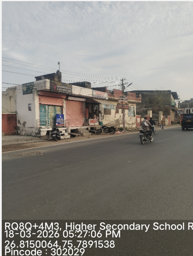
RQ8Q+4M3, Higher Secondary School R 18-03-2026 05:27:06 PM 26.8150064,75.7891538 Pincode : 302029

Shop inside with inventory photos establishing that the inside is of the same shop where the front photo was taken