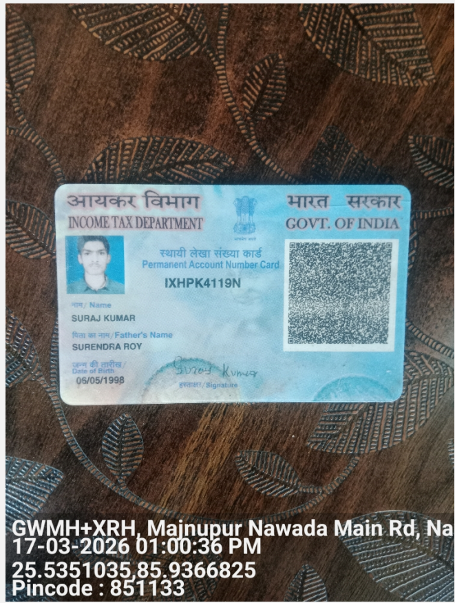
Photo of ID Proof