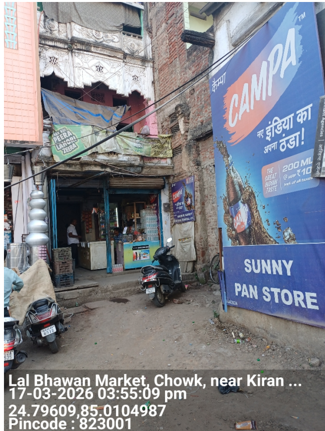
Lal Bhawan Market, Chowk, near Kiran ... 17-03-2026 03:55:09 pm 24.79609,85.0104987 Pincode : 823001

Shop inside with inventory photos establishing that the inside is of the same shop where the front photo was taken