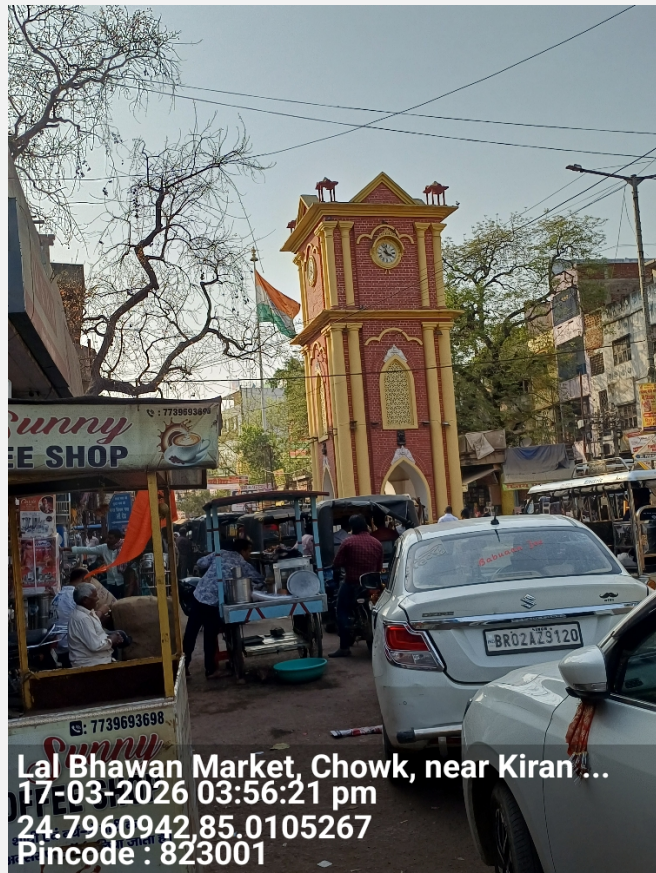
Lal Bhawan Market, Chowk, near Kiran ... 17-03-2026 03:56:21 pm 24.7960942,85.0105267 Pincode : 823001

Shop front with horizontal view covering the left & right of the shop establishing if the shop is an individual structure, in a marketplace, highway, isolated place, in a cluster framework.