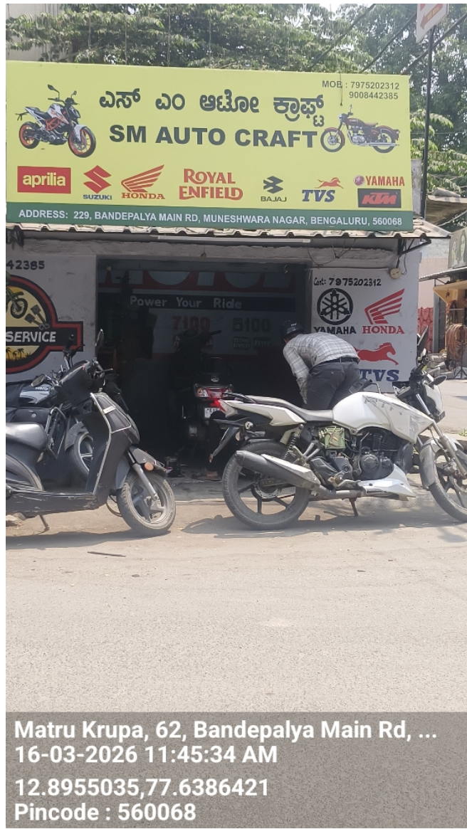
Matru Krupa, 62, Bandepalya Main Rd, ... 16-03-2026 11:45:34 AM 12.8955035,77.6386421 Pincode : 560068

Shop front with horizontal view covering the left & right of the shop establishing if the shop is an individual structure, in a marketplace, highway, isolated place, in a cluster framework.