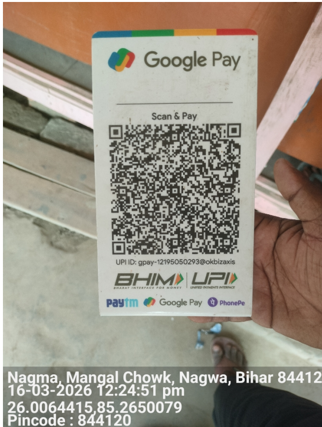
Photo with UPI Scanner