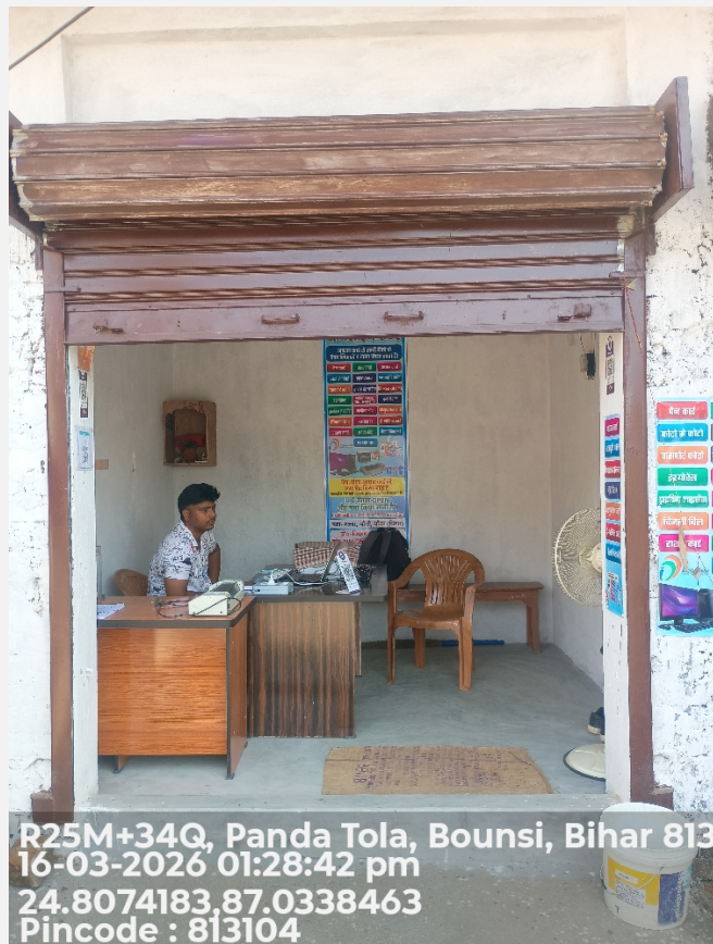
Shop Photo Outside

R25M+34Q, Panda Tola, Bounsi, Bihar 813 16-03-2026 01:28:42 pm 24.8074183,87.0338463 Pincode : 813104