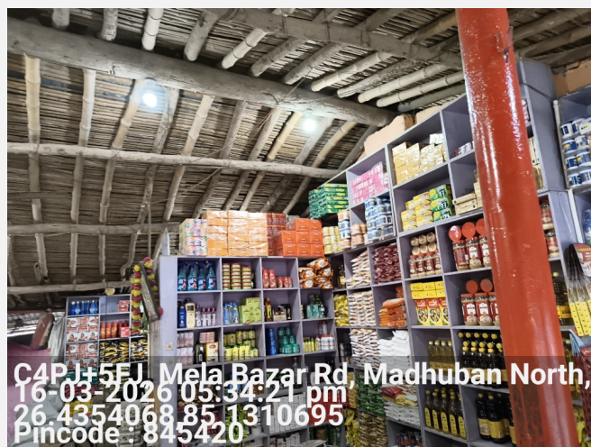
Photo of Stock