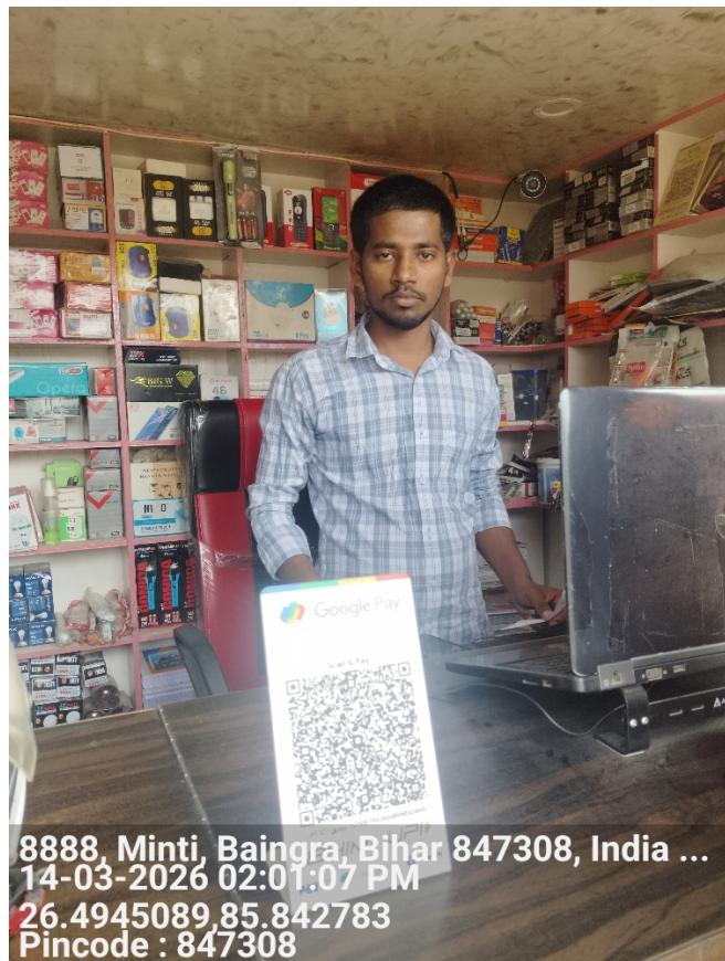
Photo with UPI Scanner