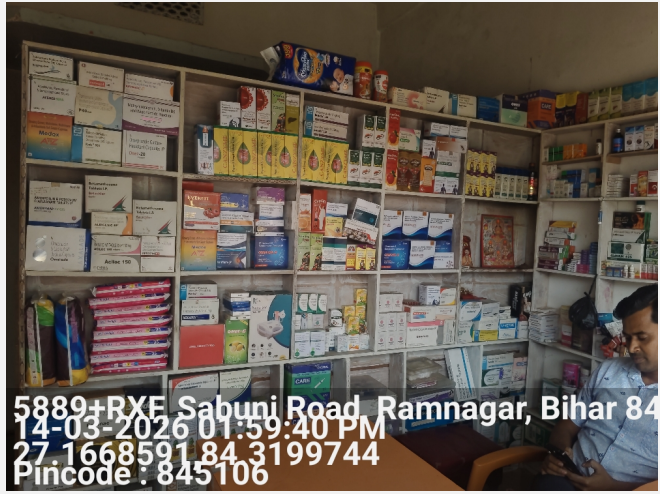
Photo of Stock