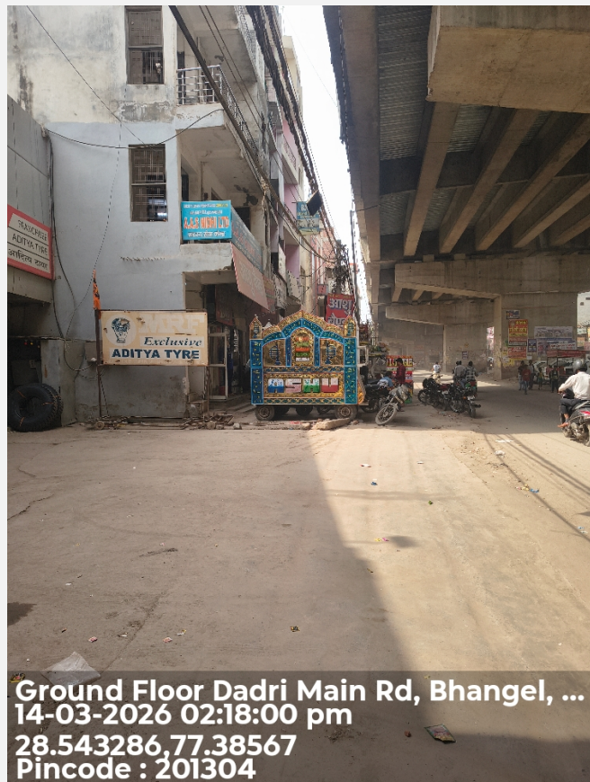
Ground Floor Dadri Main Rd, Bhangel, ... 14-03-2026 02:18:00 pm 28.543286,77.38567 Pincode : 201304

Shop inside with inventory photos establishing that the inside is of the same shop where the front photo was taken