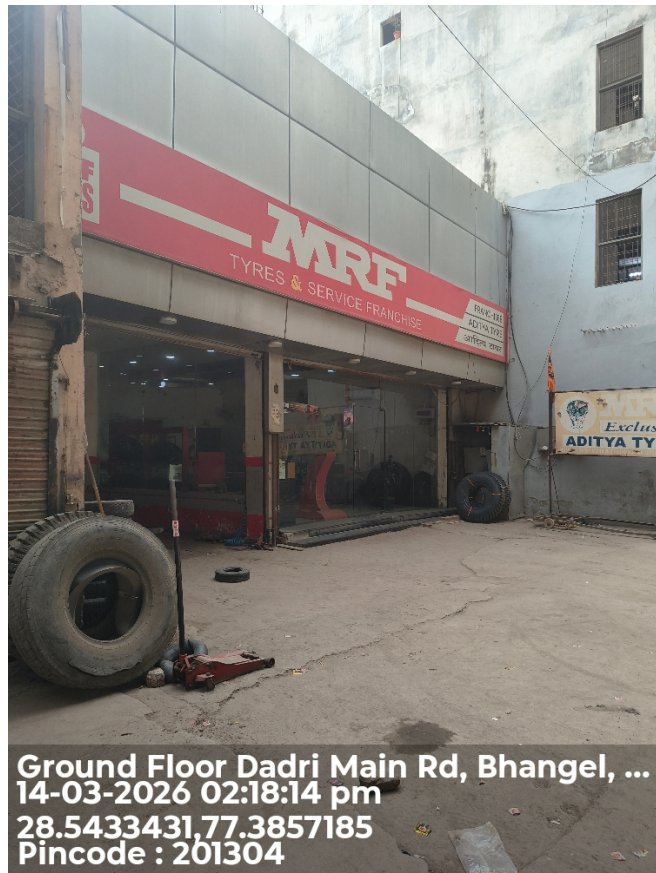
Ground Floor Dadri Main Rd, Bhangel, ... 14-03-2026 02:18:14 pm 28.5433431,77.3857185 Pincode : 201304

Shop front with horizontal view covering the left & right of the shop establishing if the shop is an individual structure, in a marketplace, highway, isolated place, in a cluster framework.