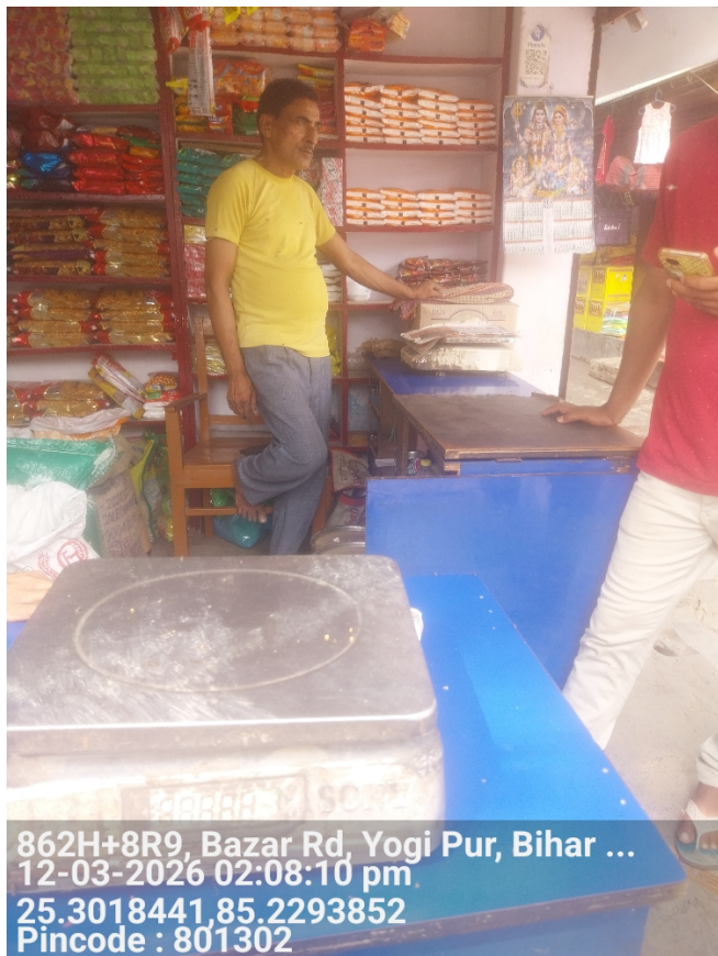
Photo of Machinery Setup