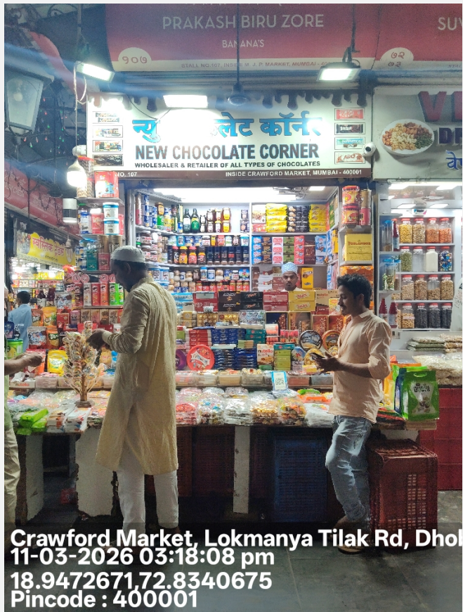
Crawford Market, Lokmanya Tilak Rd, Dhok 11-03-2026 03:18:08 pm 18.9472671,72.8340675 Pincode : 400001

Shop front photo with full vertical viewpoint i.e; shop board, sealing, entrance, ground on which the shop is established (cemented, pilers, bricks, stands, mud, wheels etc.)