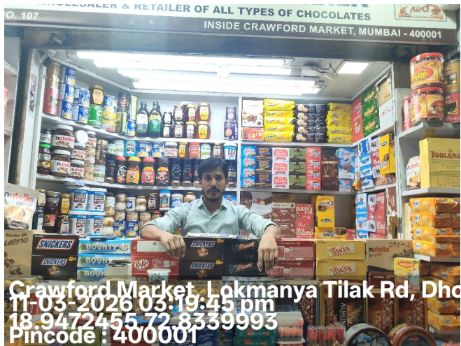
Crawford Market, Lokmanya Tilak Rd, Dhok 11-03-2026 03:19:45 pm 18.9472455,72.8339993 Pincode : 400001

Take Photo of Person Met Inside the Shop