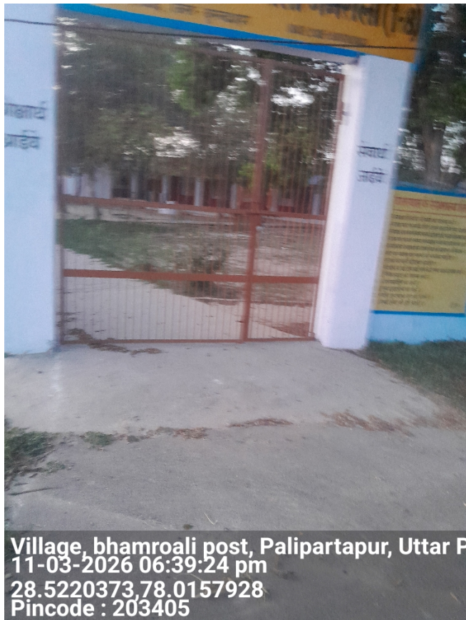
Village, bhamroali post, Palipartapur, Uttar P 11-03-2026 06:39:24 pm 28.5220373,78.0157928 Pincode : 203405

Take Photo of QR Code/Soundbox/EDC Machine