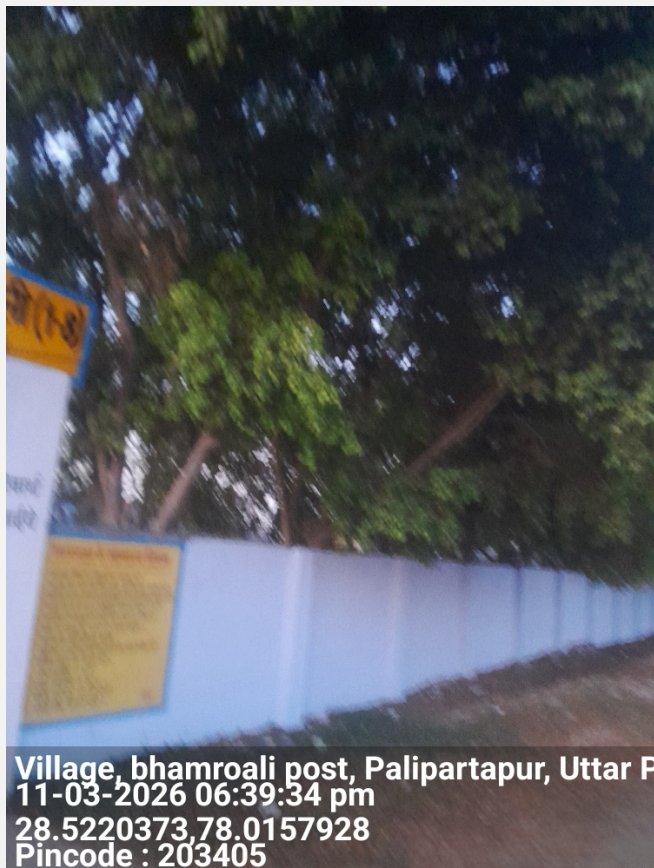
Village, bhamroali post, Palipartapur, Uttar P 11-03-2026 06:39:34 pm 28.5220373,78.0157928 Pincode : 203405

Shop front with horizontal view covering the left & right of the shop establishing if the shop is an individual structure, in a marketplace, highway, isolated place, in a cluster framework.