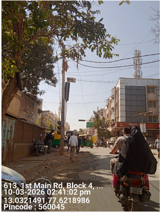
Photo with Agent