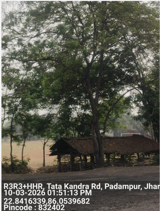
Photo of Outside Shop