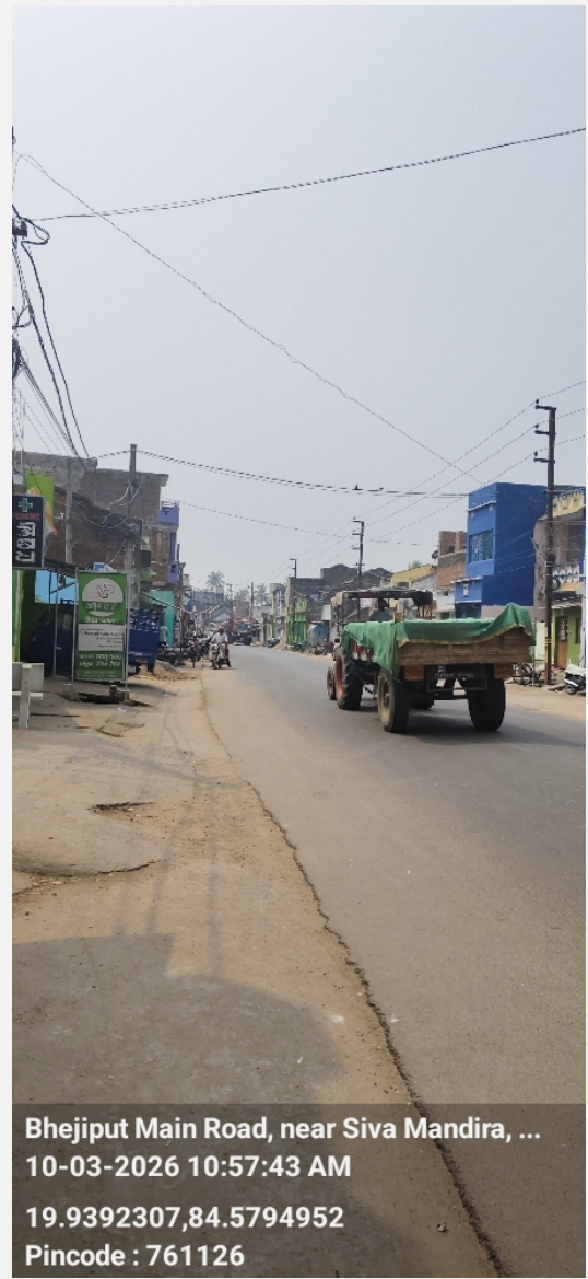
Bhejput Main Road, near Siva Mandira, ... 10-03-2026 10:57:43 AM 19.9392307,84.5794952 Pincode : 761126

20 residence_photo_with_inside_household