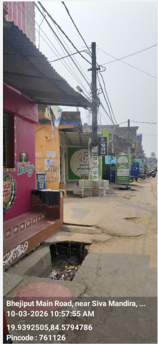
Bhejiput Main Road, near Siva Mandira, ... 10-03-2026 10:57:55 AM 19.9392505,84.5794786 Pincode : 761126