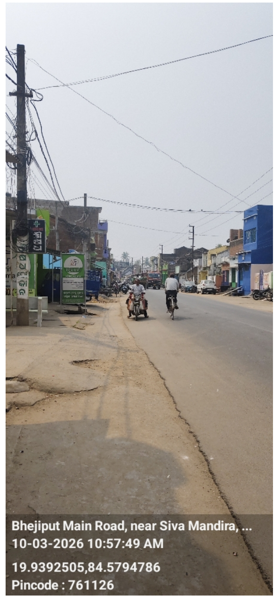
Bhejiput Main Road, near Siva Mandira, ... 10-03-2026 10:57:49 AM 19.9392505,84.5794786 Pincode : 761126