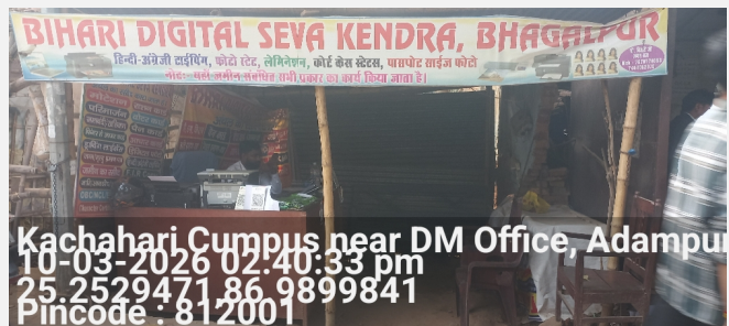
Shop Photo Outside

Kachahari Cumpus near DM Office, Adampur 10-03-2026 02:40:33 pm 25.2529471,86.9899841 Pincode : 812001