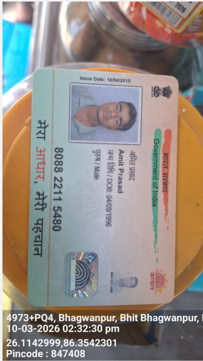
Photo of ID Proof