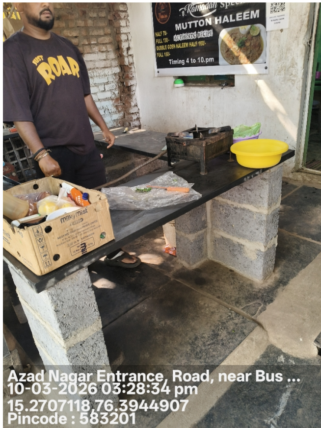
Photo of Machinery Setup