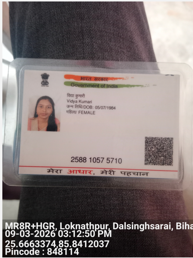
Photo of ID Proof