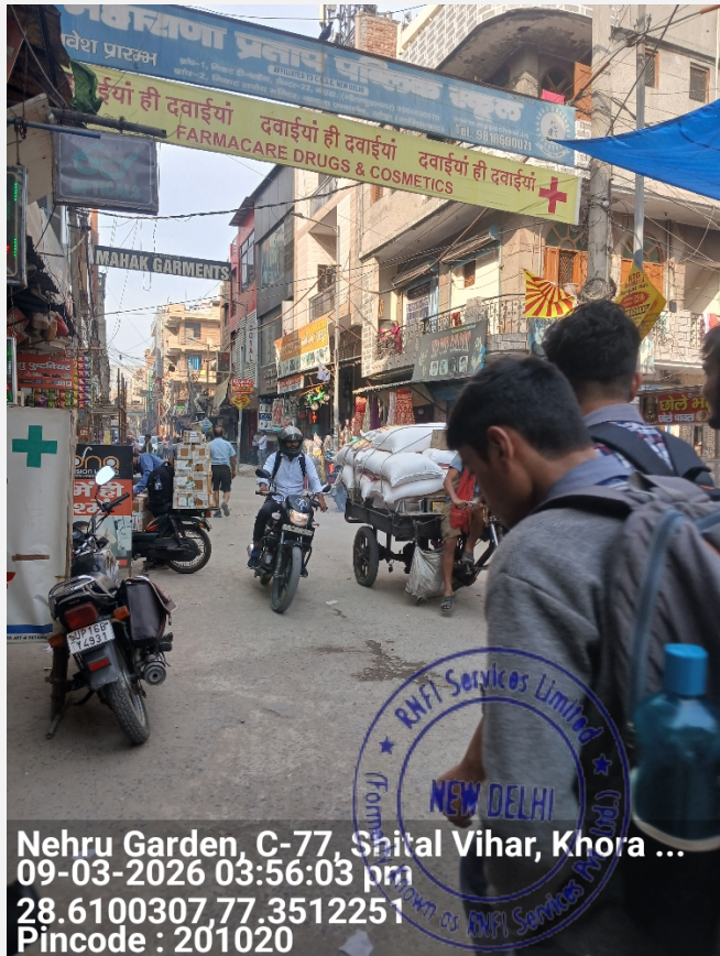
Nehru Garden, C-77, Shital Vihar, Khora ... 09-03-2026 03:56:03 pm 28.6100307,77.3512251 Pincode : 201020