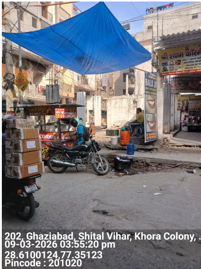
202, Ghaziabad, Shital Vihar, Khora Colony, . 09-03-2026 03:55:20 pm 28.6100124,77.35123 Pincode : 201020

Shop inside with inventory photos establishing that the inside is of the same shop where the front photo was taken