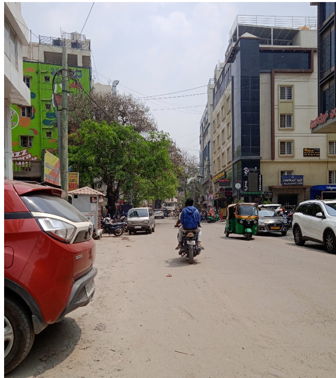
Building, 159, Outer Ring Rd, Vyalikaval ... 09-03-2026 12:47:10 pm 13.0405585,77.6191846 Pincode : 560045

Shop inside with inventory photos establishing that the inside is of the same shop where the front photo was taken