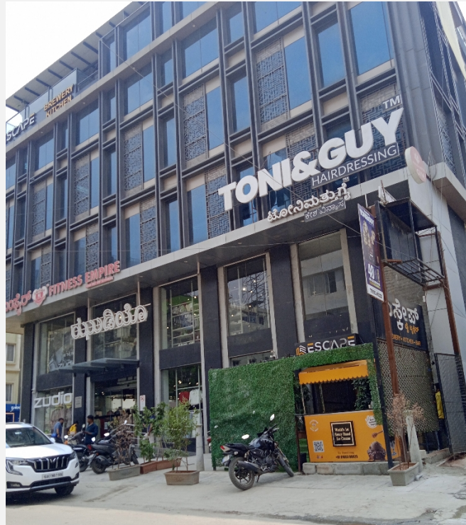
2, Philomena Hospital Rd, Vyalikaval HBCS . 09-03-2026 12:47:30 pm 13.0406407,77.6191754 Pincode : 560045

Shop front with horizontal view covering the left & right of the shop establishing if the shop is an individual structure, in a marketplace, highway, isolated place, in a cluster framework.