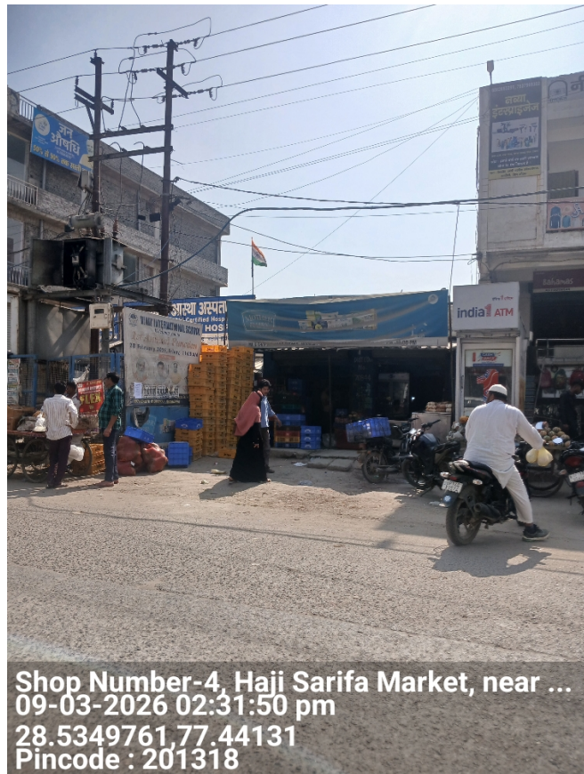
Shop Number-4, Haji Sarifa Market, near ... 09-03-2026 02:31:50 pm 28.5349761,77.44131 Pincode : 201318

Shop front photo with full vertical viewpoint i.e; shop board, sealing, entrance, ground on which the shop is established (cemented, pilers, bricks, stands, mud, wheels etc.)