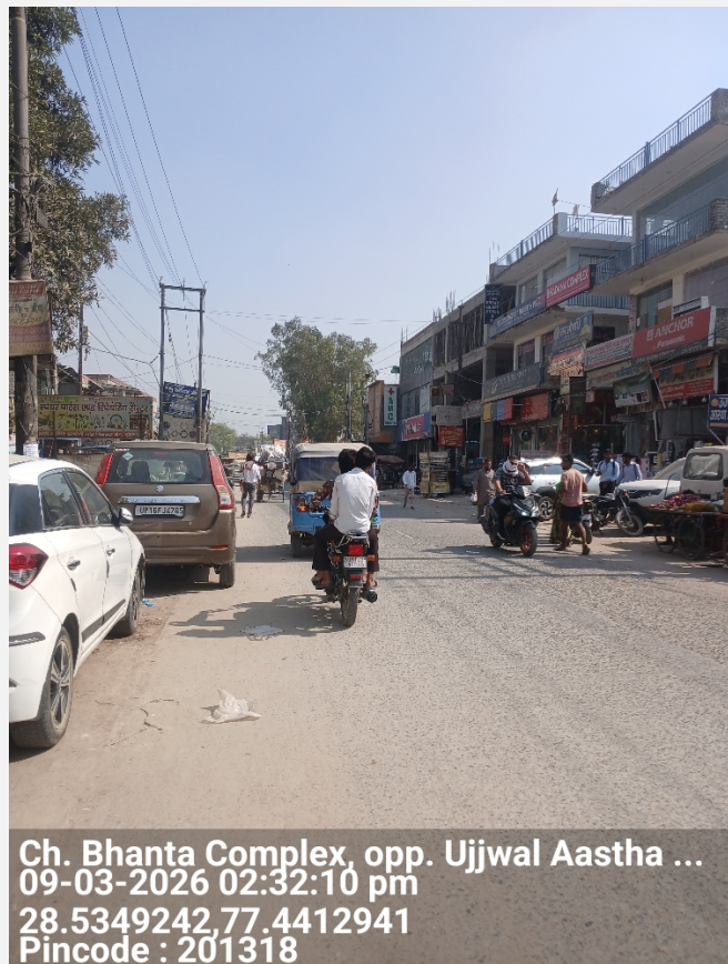
Ch. Bhanta Complex, opp. Ujjwal Aastha ... 09-03-2026 02:32:10 pm 28.5349242,77.4412941 Pincode : 201318

Take Photo of Person Met Inside the Shop