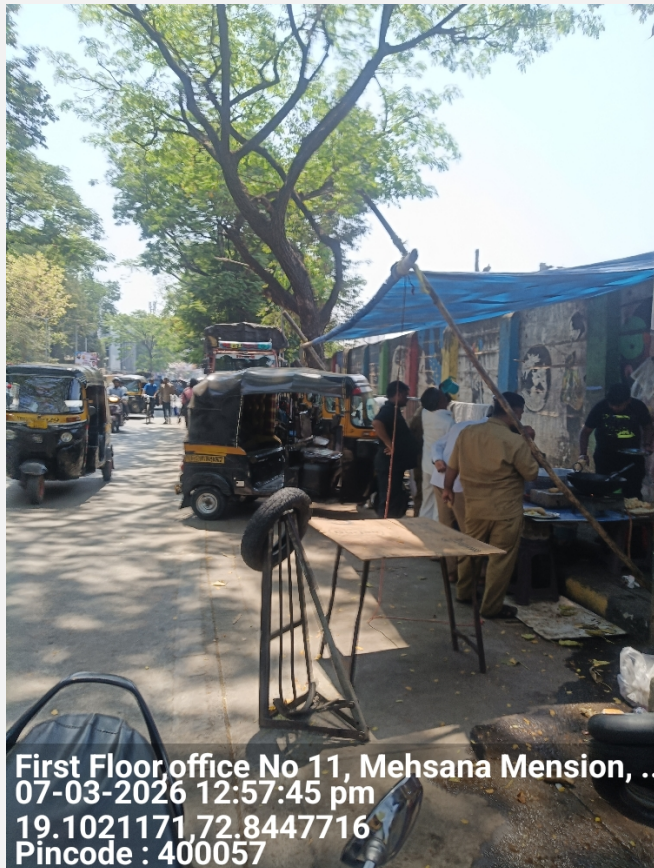
First Floor,office No 11, Mehsana Mension, .. 07-03-2026 12:57:45 pm 19.1021171,72.8447716 Pincode : 400057

Shop inside with inventory photos establishing that the inside is of the same shop where the front photo was taken