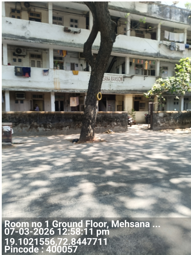
Room no 1 Ground Floor, Mehsana ... 07-03-2026 12:58:11 pm 19.1021556,72.8447711 Pincode : 400057

Shop front with horizontal view covering the left & right of the shop establishing if the shop is an individual structure, in a marketplace, highway, isolated place, in a cluster framework.