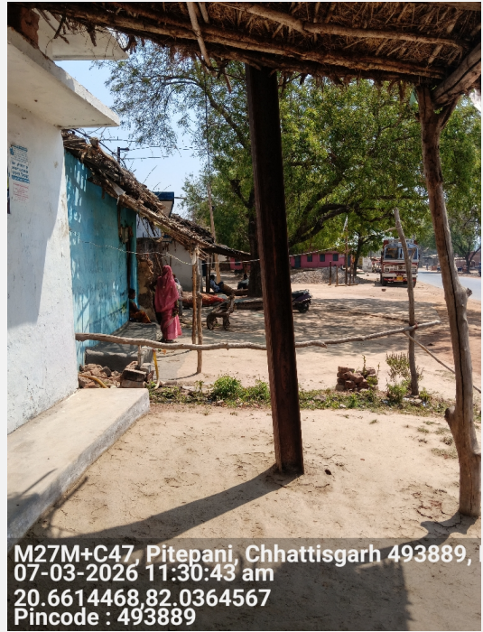
Photo with Agent

M27M+C47, Pitepani, Chhattisgarh 493889, 07-03-2026 11:30:43 am 20.6614468,82.0364567 Pincode : 493889